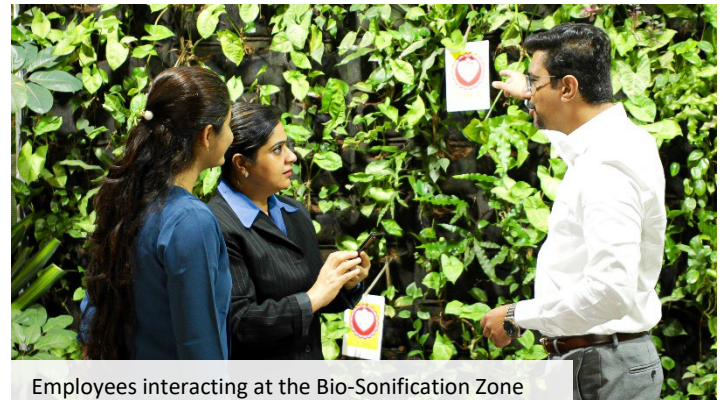
Employees interacting at the Bio-Sonification Zone

The music generated by the plants is further converted into QR codes, displayed on the plants for visitors to scan and listen to, anytime they visit. This project has met with enormous enthusiasm, with over 2500 scans on the QR codes being garnered since unveiling.